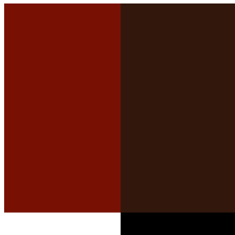
Masstone Alkyd / Melamine