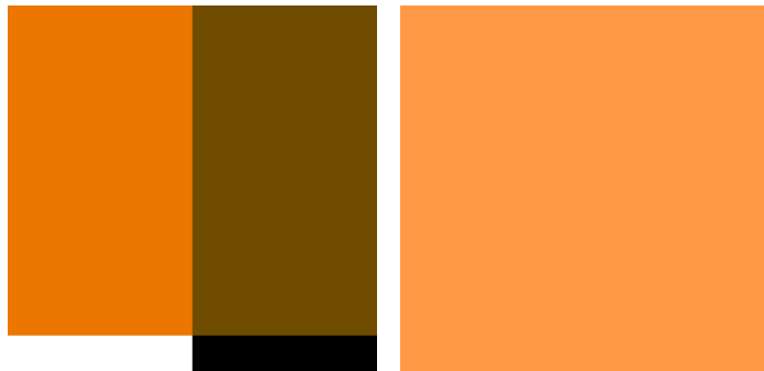
Masstone Alkyd / Melamine