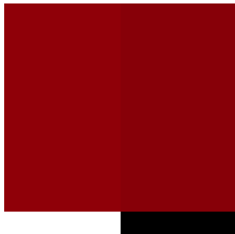
Masstone Alkyd / Melamine