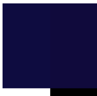
Masstone Alkyd / Melamine