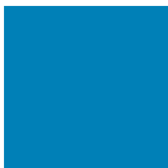
1/3 Standard Depth Alkyd / Melamine 1:11 TiO2