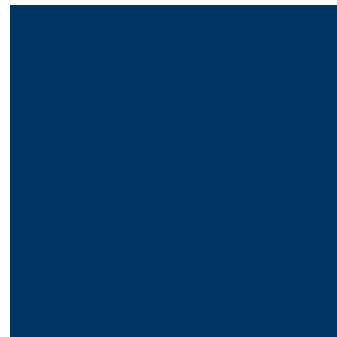
80:20 Aluminum two-coat metallic